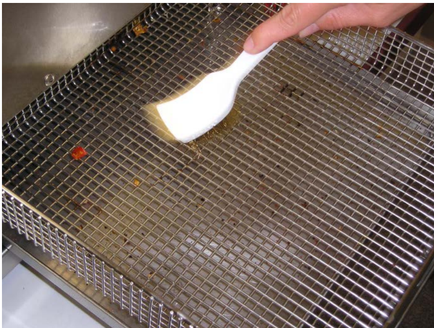
Brushing the Cooking Basket to Clean