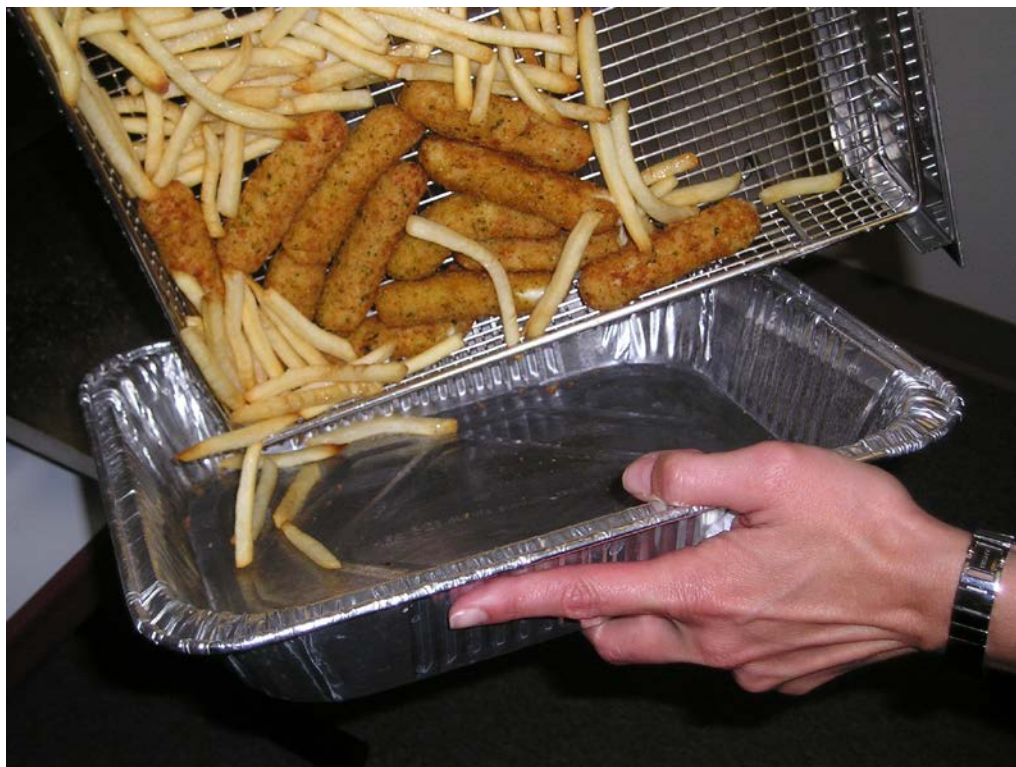
Emptying the Cooking Basket