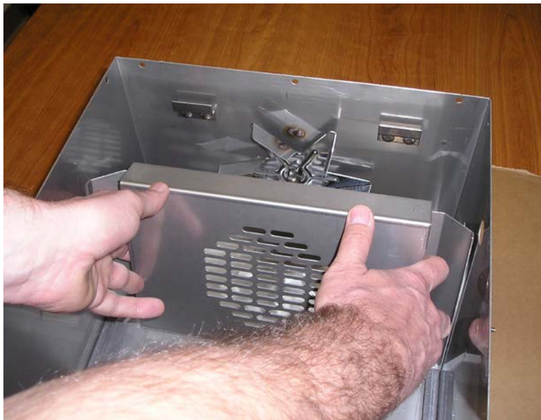
Separation Wall Cutaway View