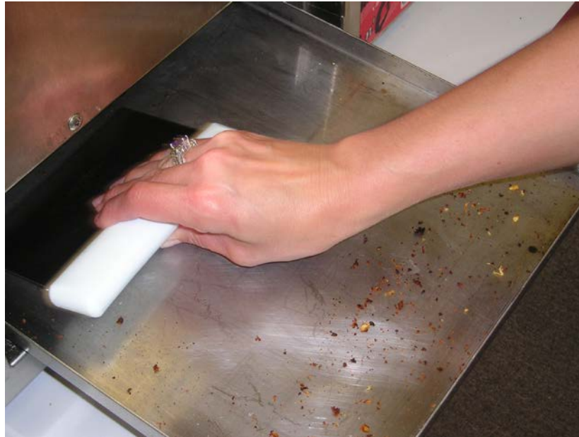
Scraping the Drip Tray to Clean

or bench scraper. Simply scrape the Drip Tray from the back to the front. Three strokes of the scraper from the rear to the front and one scrape from one side to the other should place all of the crumbs and excess oil to one of the front corners of the Drip Tray.