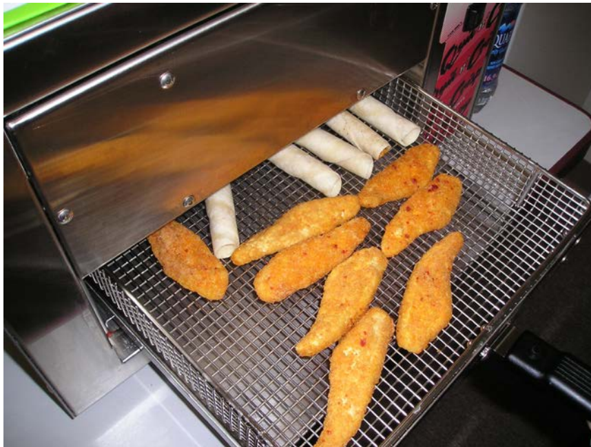
Placing Items in Cooking Basket